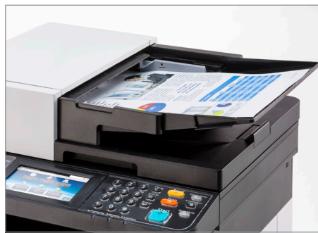
Duplex scanning automatic feeder