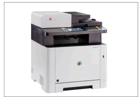
Compact and elegant design