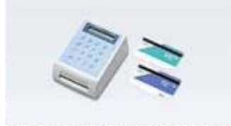
RISO Key Card Counter IVN