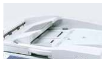
RISO Auto Document Feeder AF-VI