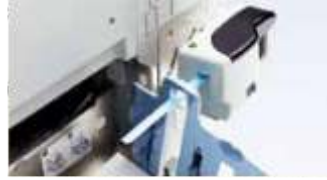
RISO Job Separator IVN III

Consumables: RISO MASTER eZ TYPE (295 sheets per roll) RISO INK eZ TYPE (1,000ml per cartridge)