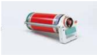
RISO EZ Drum A4