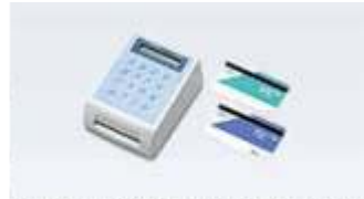
RISO Key Card Counter IV-N

RISO MASTER eZ TYPE (220 sheets per roll) RISO INK eZ TYPE (1,000ml per cartridge)