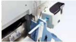
RISO Job Separator IVN III

RISO PC Interface Card USB2.0 RISO Network Card RISO Printer Driver for Macintosh RISO Accounting Tool