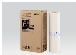
RISO MASTER FII Type (A3: 220 sheets)