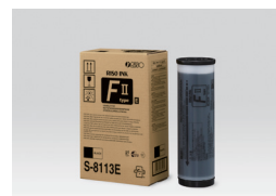
RISO INK FII Type Black (1000 ml)