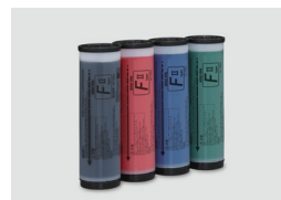
RISO INK FII Type Colour (1000 ml)

The RISO iQuality mark indicates a RISO product compatible with the RISO iQuality System.